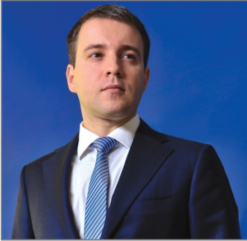
Nikolai Nikiforov Minister of Telecom and Mass Communications of the Russian Federation

At age 19, Mr. Nikiforov became Deputy Director of Kazan Portal Company. In 2006-2010, he was appointed Head of the Center of Information Technology of the Republic of Tatarstan. In 2010-2012, Mr. Nikiforov worked as Deputy Prime Minister and Minister of Informatization and Telecommunication of the Republic of Tatarstan. In May 2012 he was appointed Minister of Telecom and Mass Communications of the Russian Federation, thus becoming the country's youngest federal minister.